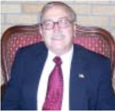
Message from the President/CEO

Published for the Employees and Staff of GIKV